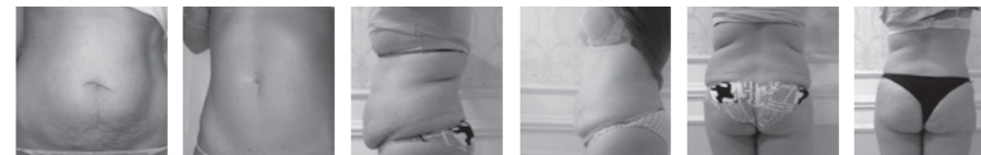
Best results for the above are to be used in conjunction with a good exercise program.

Lymph is the system that carries the waste materials away from the cells, while the blood brings in the nutrients to the cells. Stagnation of fluid makes the cells become exposed to an increased toxic condition. Increased lymphatic drainage deals with the stagnant lymph effectively.