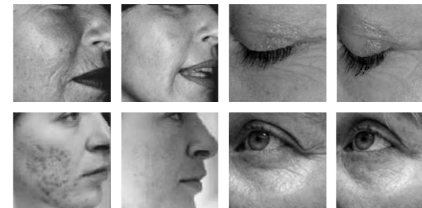
Before & after E-Dermastamp Treatments

$550 per treatment or $1650 for 3 treatments + Aftercare Kit FREE (save $200) + Post Care LED Lights (save $1500)